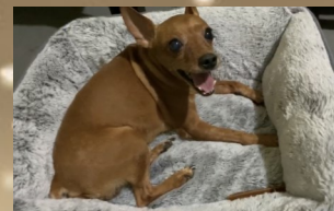
Primo the Min-Pin—age 12